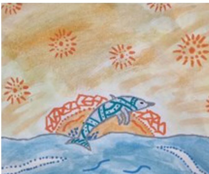
Lachie S 6B